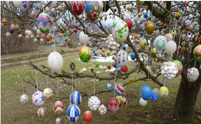
(A German Easter Egg Tree)

In many gardens around the area you also find trees decorated with Easter eggs and in the homes there are branches with colored Easter eggs hung from them.