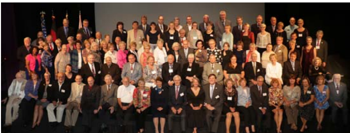
October 6, 2017 - At Glenview Mansion

https://www.youtube.com/watch?v=WDVGuDYQVae