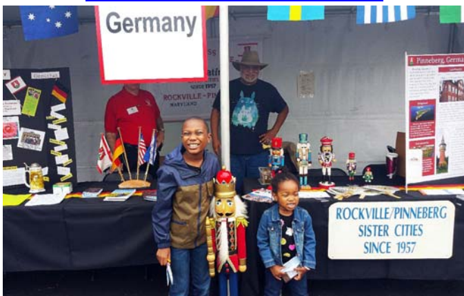
Enjoying a visit to the RSCC Booth

The World of Montgomery festival is held each year in October to celebrate the rich diversity of Montgomery County. The festivities include the traditions, music, food, dance and art from a variety of countries represented in Montgomery County’s culturally diverse community. This year’s event was held at Montgomery College in Rockville on Sunday, October 15th, from Noon-4:00 pm. The