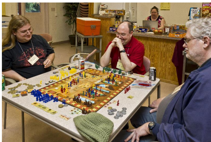
Join the fun