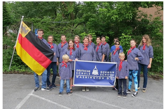
German School marchers

As in years past, the RSCC provided a contingent of marchers in Rockville’s annual Memorial Day parade. We were joined again by representatives from the German School in Potomac, and the Dragon Dancers from the Chinese Culture & Community Service Center in Gaithersburg. Both groups signified Rockville’s alignment with Pinneberg and Jiaying.