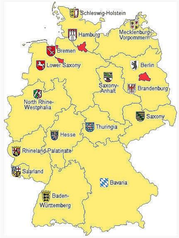
Germany's 16 "States"