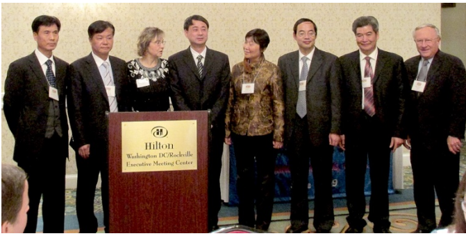
During the reception for Jiaying visitors