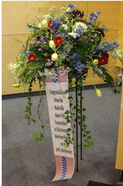
Flower arrangement of Rockville Sister City Corporation

Before we all know it 2017 will be here and the City of Rockville and RSCC will be celebrating its 60th Rockville-Pinneberg Sister City Anniversary. We are very thankful for all the corporate sponsors we have who support our program, and we are planning for the big anniversary. It is hoped that many supporters will help us celebrate in Pinneberg and in Rockville.